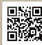
HARUNOIE Official Website

MAIL info@shimayado.work URL https://shimayado.work/