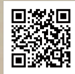
Around HARUNOIE area map